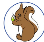
Curdworth Primary School