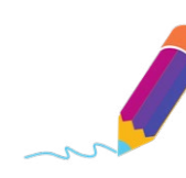
Two Gates Primary School