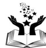
Deykin Avenue Junior & Infant School