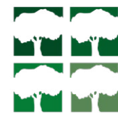
Hill West Primary School