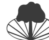
Stockland Green School