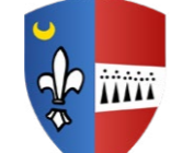
The Coleshill School