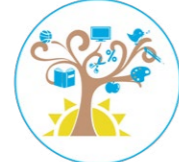
Osborne Primary School