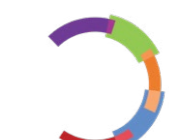
The Bridge Academy