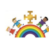
St Chad's CE Primary School